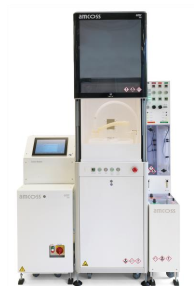
amr 300 mask cleaner