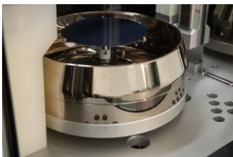
Solvent module for lift-off or resist strip for standard solvents and various lift-off techniques

Extra-slim control module (200 x 600 mm) with touch screen on moveable arm for minimum space requirements. One process module can be connected.